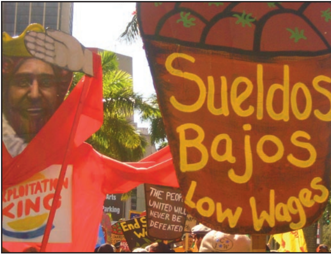
CIW Protesting Burger King in Miami

In the Field: The Coalition of Immokalee Workers , in alliance with the student-led Fair Food Challenge, have successfully campaigned to end modern-day slavery in Florida's tomato fields. Their combined pressure convinced Taco Bell, McDonald's, Burger King, Whole Foods and others to buy only from growers who agreed to pay another penny a pound to pickers.