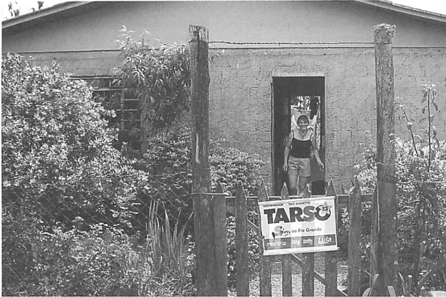
An MST settler in the doorway of her house, on land she and her family and others won in an occupation.

a process that typically takes two to four years. In the meantime, landlords or police may attack the encampment repeatedly, abusing, beating, and imprisoning people. Several hundred MST leaders have been assassinated in these struggles. Even more rural leaders not affiliated with the MST have been murdered, as they do not enjoy the support and protection the MST affords. In spite of the problems, however, the people's deep hunger for land and the organizational skill of the MST have made it possible for people in thousands of encampments to succeed in getting land.