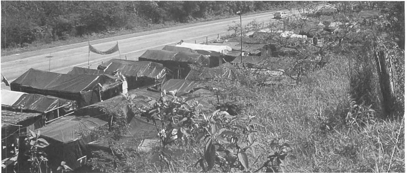
An MST encampment in Rio Grande do Sul, Brazil's southernmost state. These black plastic tents are typical of the encampments where MST members spend months or years before gaining title to land.

occupying land in the continuing battle to make agrarian reform an enduring reality in Brazil. In addition, approximately 200,000 families who are not members of the MST have also received land in the agrarian reform sparked by the MST.