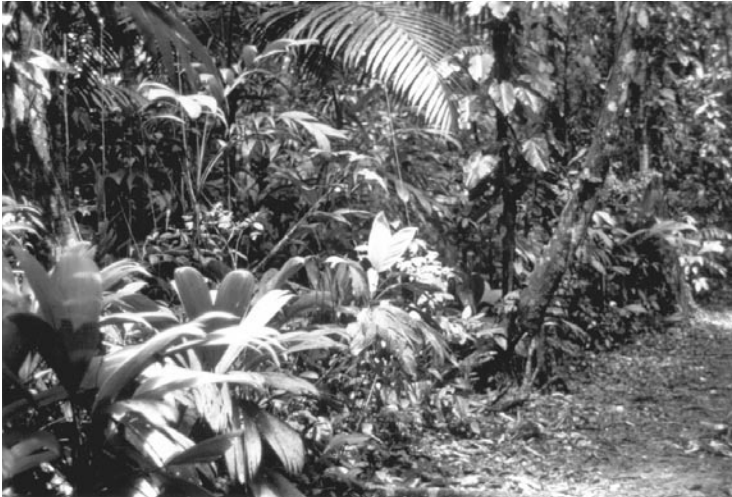
Figure 1.1. The lowland tropical rain forest of Central America. Note the wide variety of vegetative forms evident.