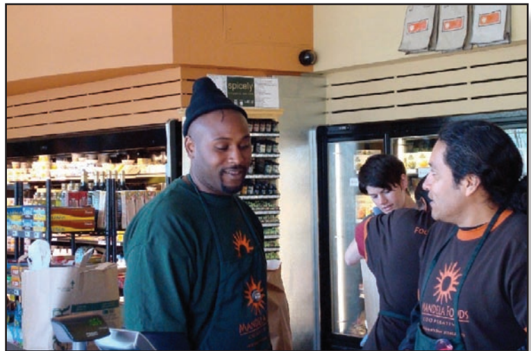
Mandela Market Coop

Like the FFFI in Pennsylvania, the federal HFFI is poised to attract and benefit independent retailers. However, the $400 million program failed to secure funding during the FY2011 budget negotiations . While the departments in charge of HFFI (Treasury, USDA and Health and Human Services) are implementing some programs with existing resources, the combined $20 million is a drop in the bucket compared to corporate cash flows. As the FY2012 budget negotiations unfold, HFFI's ambitious programs may never come to fruition.