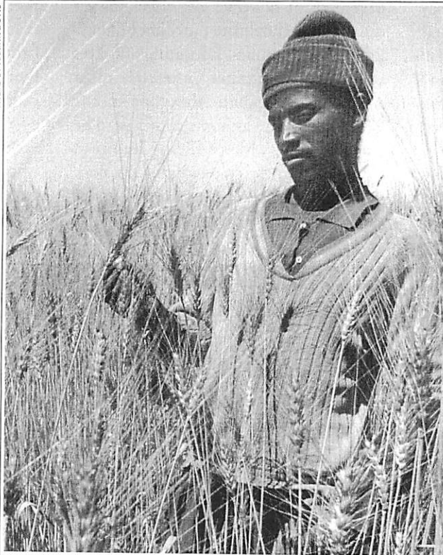
THE GOAL OF ENDING HUNGER IS NO MORE UTOPIAN THAN WAS THE GOAL OF ABOLISHING SLAVERY.