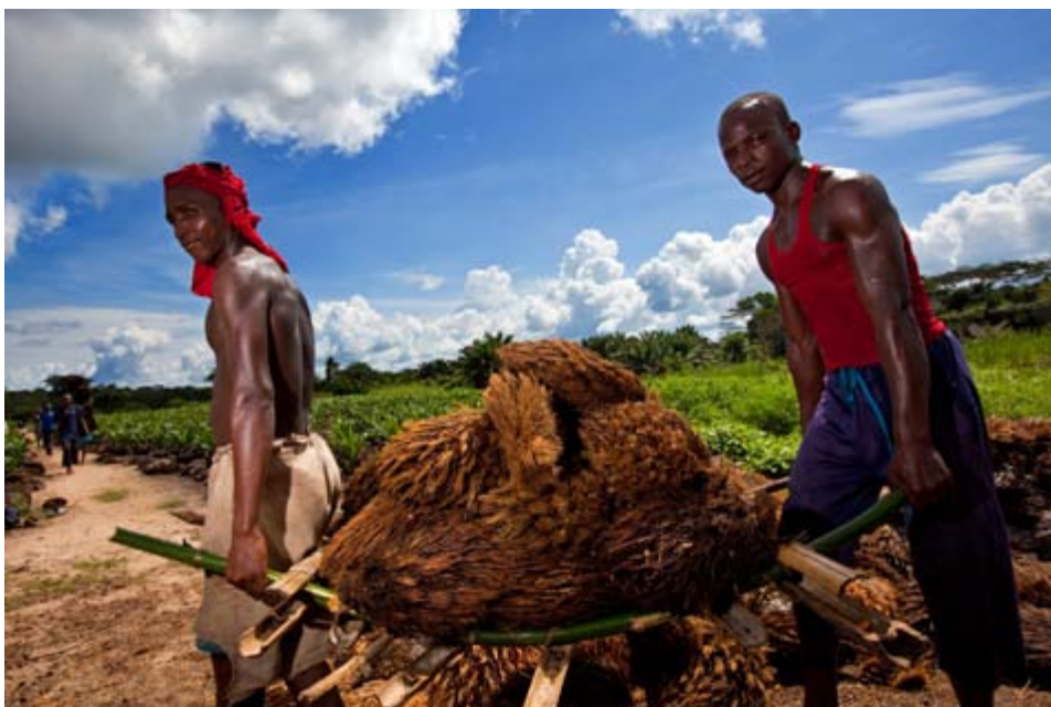
Workers at the oil palm plantation at Lokutu

Beyond their own policies and standards, Feronia and its DFI owners are also collectively committed to adhere to the World Bank Group Environmental, Health and Safety Guidelines; the Round Table for Sustainable Palm Oil Principals and Criteria for the Production of Sustainable Palm Oil; the World Bank’s IFC Performance Standards on Environmental and Social Sustainability; the Uniform Framework for Preventing and Combating Fraud and Corruption; the IFC Corporate Governance Development Framework; the OECD Guidelines for Multinational Enterprises; and the ILO Forced Labour Convention. 14