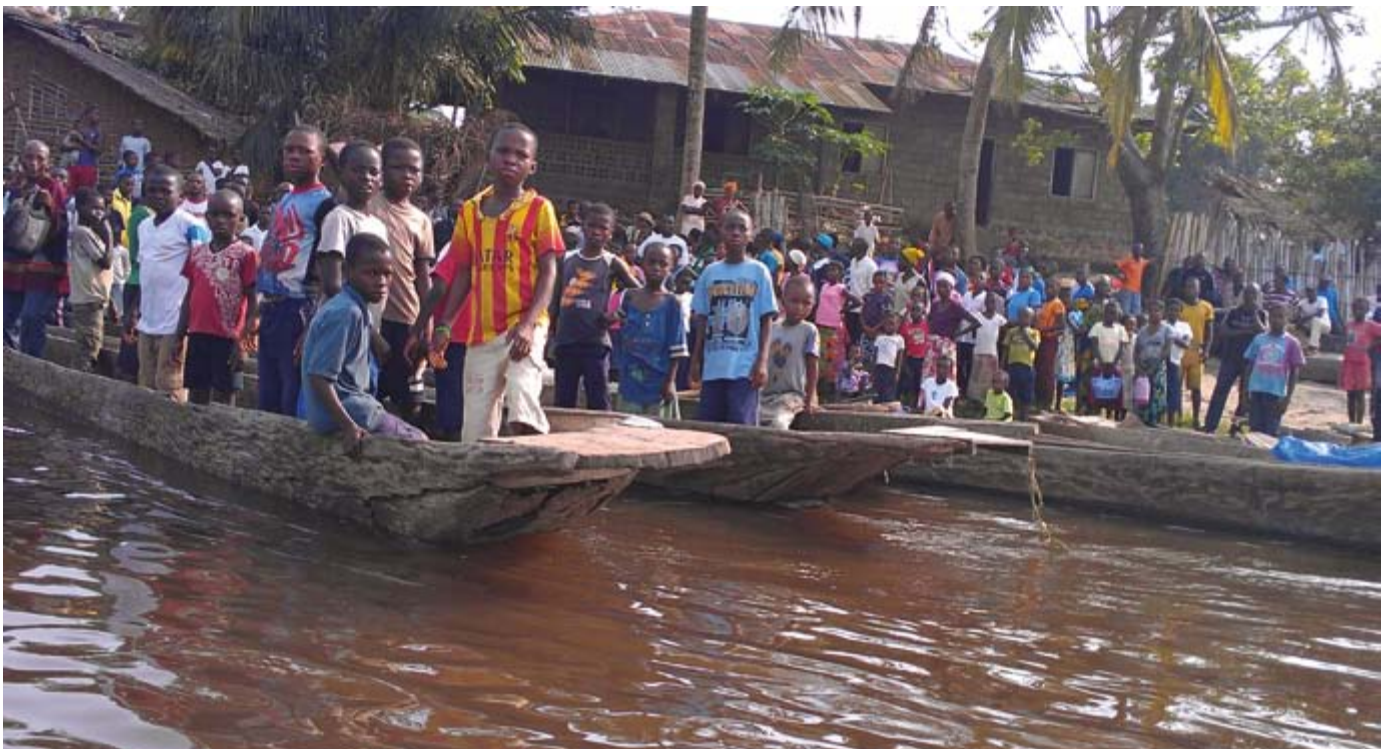
Children at the Lokutu landing.

European and US development finance is bankrolling a new round of colonialism in the DRC