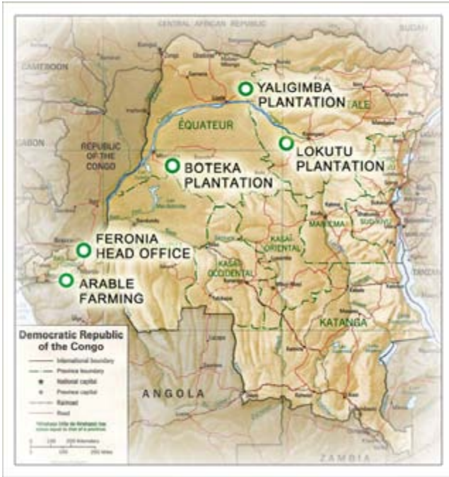
Map of Feronia's plantations and farm

to plant crops and raise livestock in the abandoned areas of the plantation. But when it was time to harvest, the company destroyed all the crops and ordered the people out by force. It's as if the company wants to ensure that the people stay dependent on it for their survival. It's like a system of slavery."