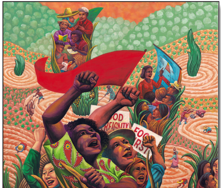
Poster for the 40 th anniversary of Food First by Boy Dominguez.

For four decades Food First has been the U.S.'s primary think tank providing trenchant analyses of the root causes of hunger. We've highlighted the alternatives for a sustainable and equitable food system, linked the issues and formulated strategies with the growing food movement through our work of education for change , research for action and projects for transformation . We've done it all with the social movements for economic justice and food sovereignty and with you—our staunch supporters. Thank you!