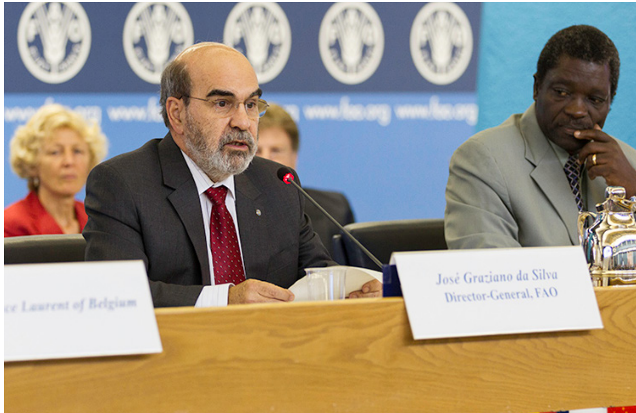
Food and Agriculture Organization of the United Nations (FAO) Director-General José Graziano da Silva.