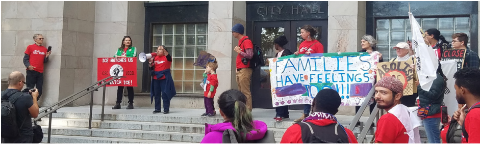
USFSA Protests Bellingham's Unwillingness to Protect Immigrants from I.C.E.

ed us that we “can overcome these crises with social mobilization.” Joan Brady of the National Farmers Union in Canada highlighted how food sovereignty serves as a “framework for change. It gives us a picture of what the future can look like.”