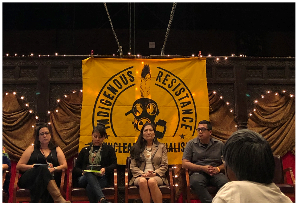
Much of CJA centered indigenous activists of New Mexico .

We all know that our climate is in crisis and there is no shortage of analysis explaining why. But it is much harder to form solutions or to articulate what