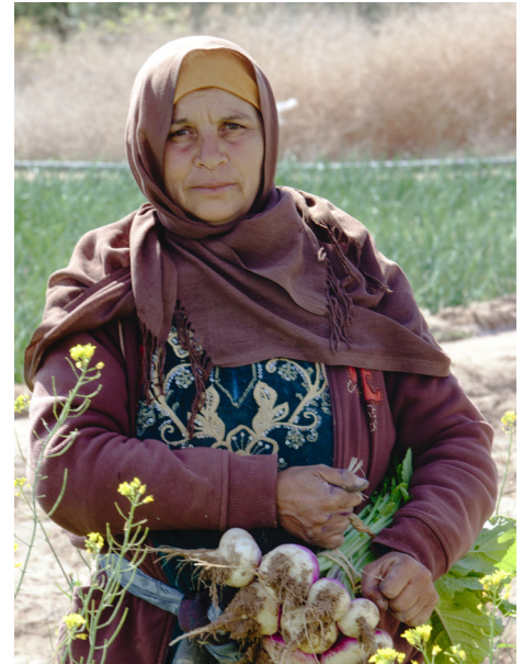
A Tunisian peasant farmer.

Ayeub makes a passionate plea for Tunisians to refuse both the free trade agreement and the status-quo of dependency by piv-