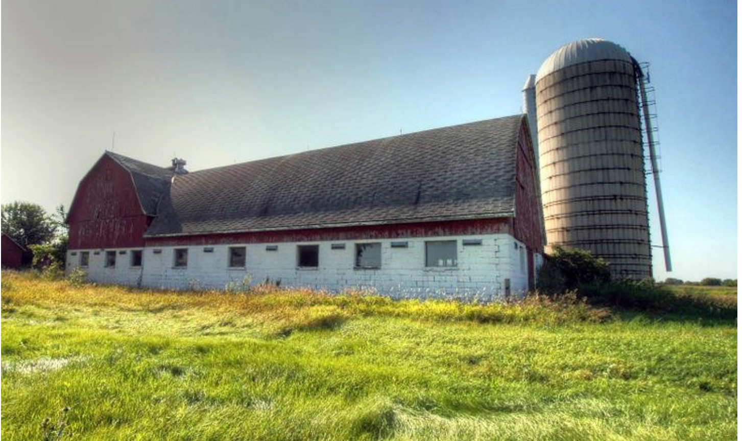
Abandoned Dairy Farm Barn.