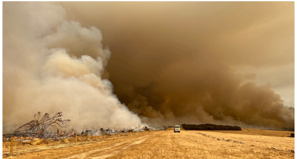
Australia's wildfires this past year reflect a fast-changing climate.

sation for the workers who are the foundation of our food system. They highlight how workers are imposing new expectations on employers and the government, fighting to make this pandemic moment an opportunity to gain the long overdue rights that labor deserves.