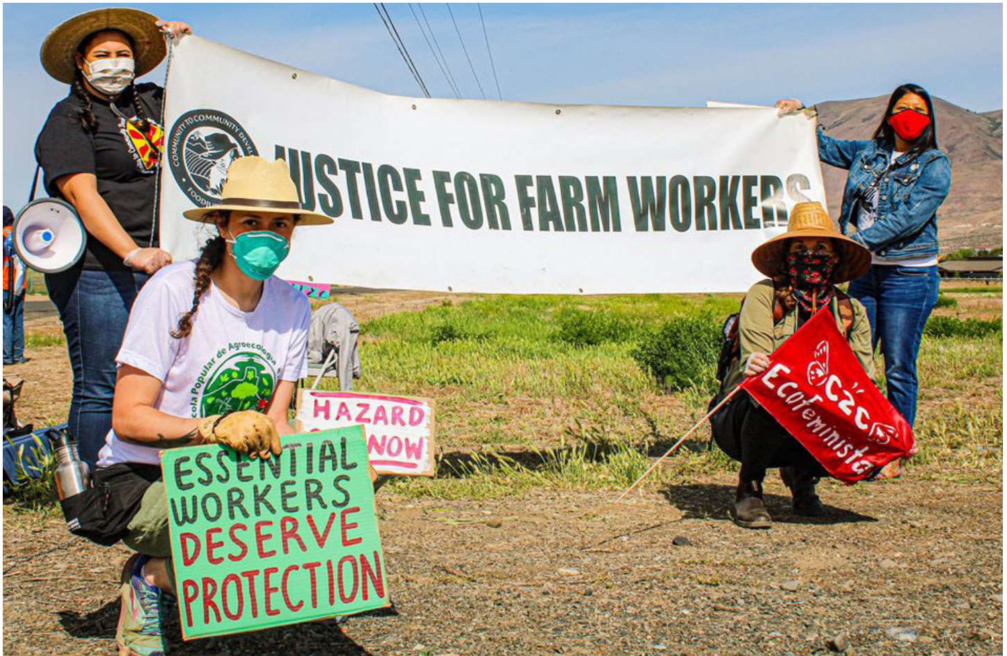
Farmworkers in Washington strike in May over working conditions and wages.